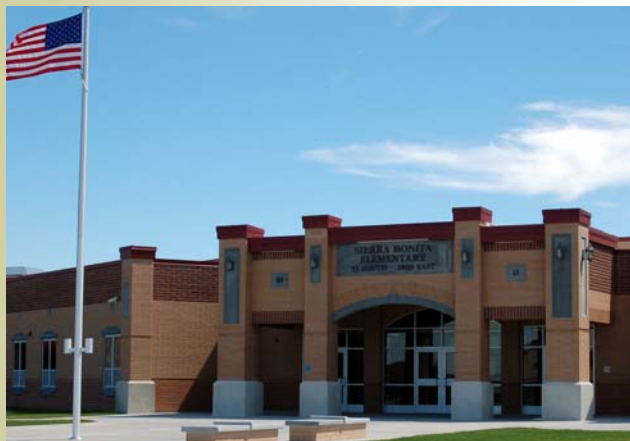
Sierra Bonita is Nebo School District's 27th elementary school.

Sierra Bonita is located at 53 South and 1800 East in Spanish Fork. Many of the children live close by and some come from the Mapleton area as well as the east side of Spanish Fork.