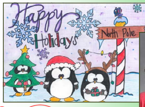
Third Place: Shelbee Reid,

Cover for 2015 Nebo Education Foundation Christmas card