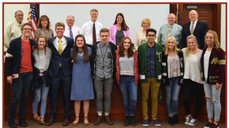
Nebo Youth Board meets with Superintendent & School Board