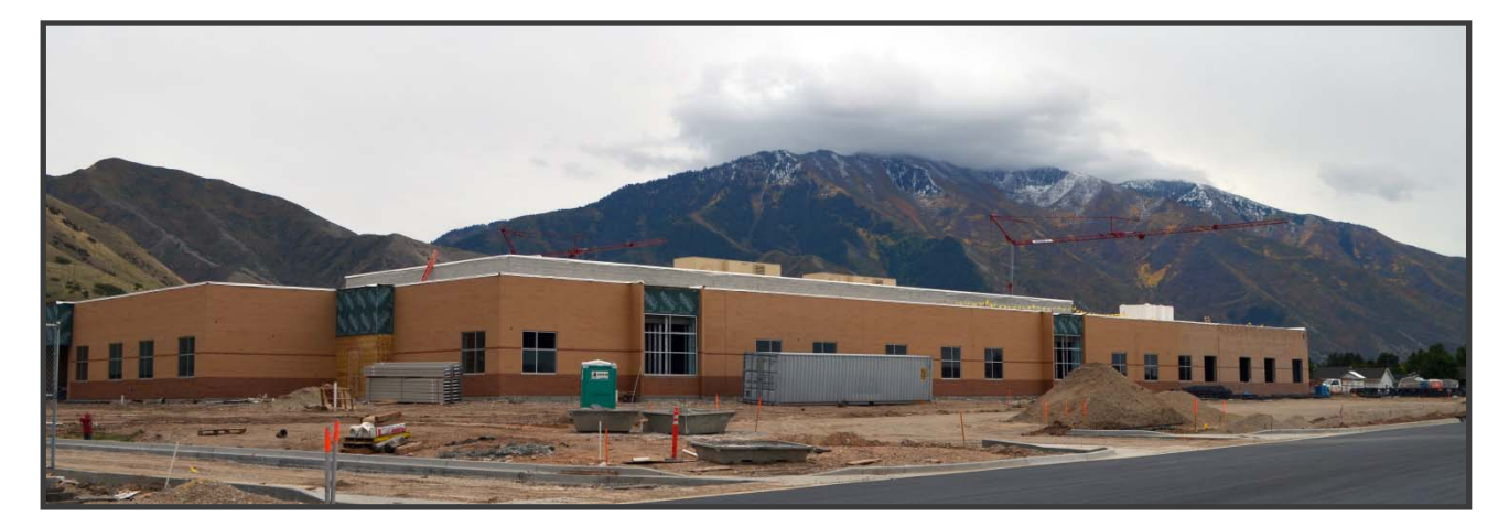
Springville Junior is right on schedule to open Fall of 2014

is to provide each student with quality instruction, learning opportunities, and educational environments which inspire classroom success, personal excellence, and responsible citizenship.